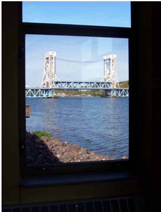
The view from the west end of the library. "It feels like you are floating on the water," one library staffer said.