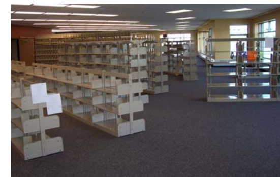
Above: architect's rendering of the new library. Below: the move begins.

The new library will include expanded computer access, both wired and wireless.